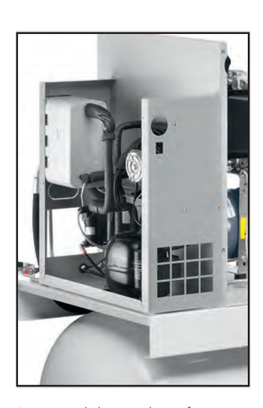
Integrated dryer reduces footprint