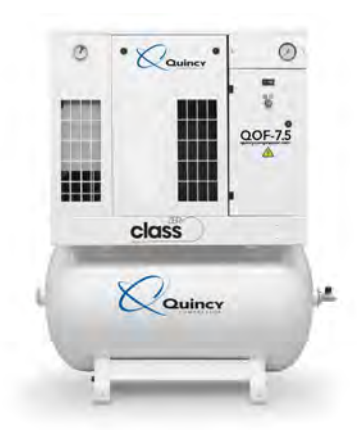
Quincy QOF-7.5 shown

Outstanding reliability, low maintenance and operating costs make oil-free compressors a sound investment.