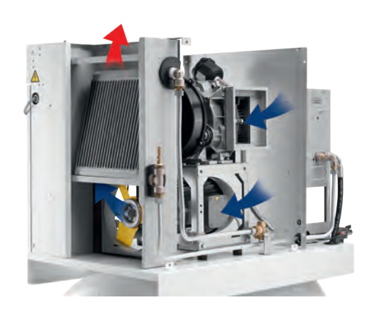
Vertical design increases ventilation